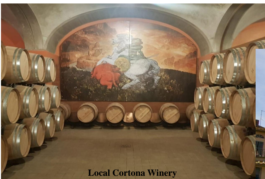
Local Cortona Winery