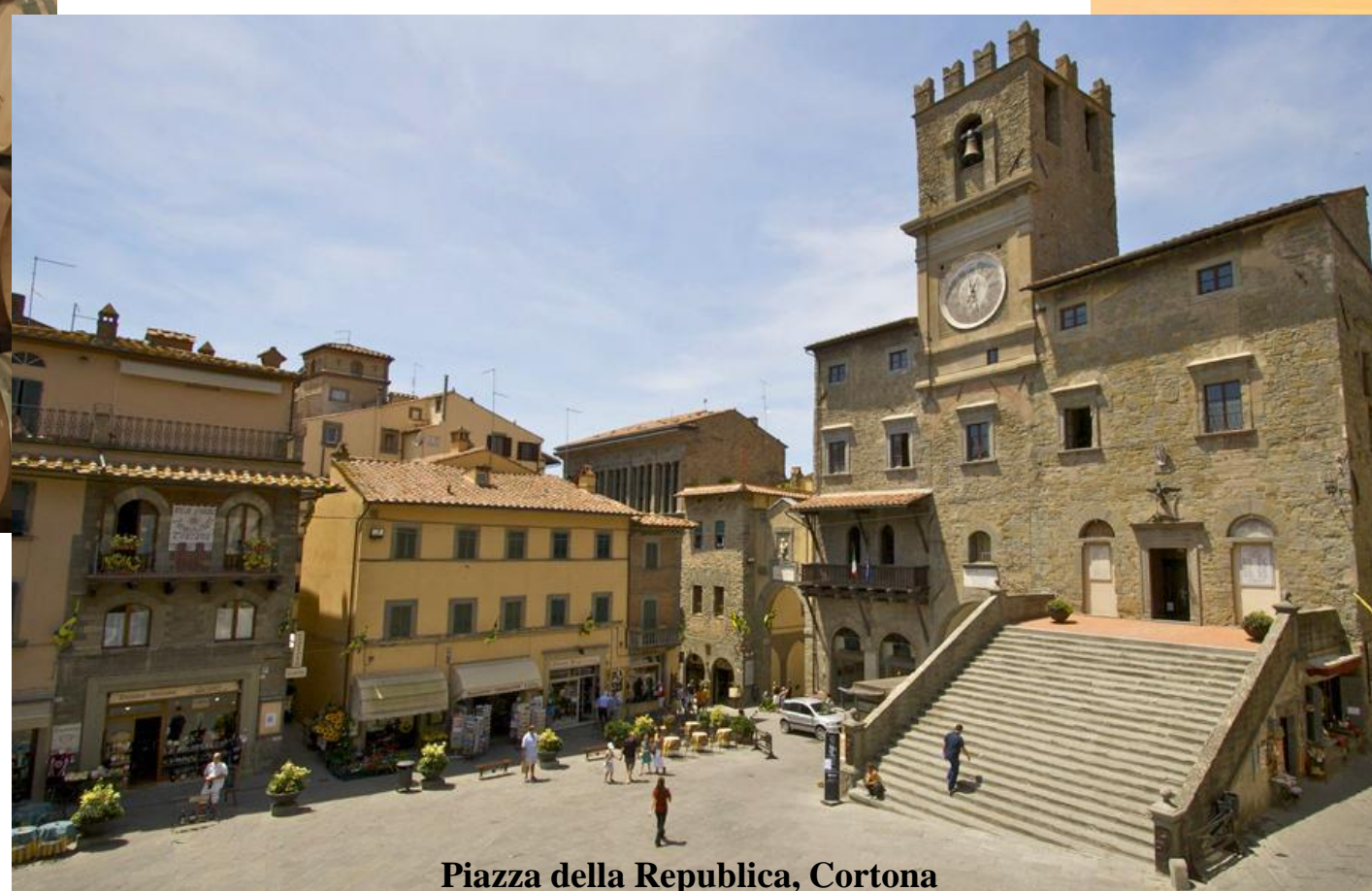
Piazza della Repubblica, Cortona

Please Note: Travel needs to be booked within one year and travelled within two years. As well, travel must be booked a minimum of 60 days in advance and reservations are subject to availability. Once booked, all reservations are final. Photos shown are examples only and actual lodging may vary, as multiple comparable properties with the same quality standards are used in order to insure availability. With our apologies, these properties are not wheelchair accessible. Visitors tax of approximately $10 per person will be required by Cortona's Municipality upon arrival. All certificates should be handled with care as they are needed to book your stay. This package may not be re-sold or offered for bidding at any other auction.