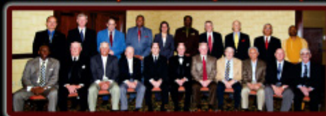
Hall of Fame Past Inductees - 40th Anniversary