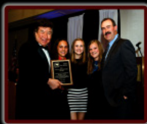
Eastdale Little League Softball Team