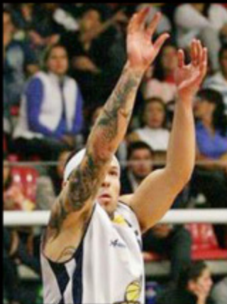
ROMAN ANDRADE FIBA - INTERNATIONAL BASKETBALL FEDERATION