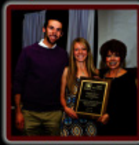
UNM Men's & Women's Cross Country Teams