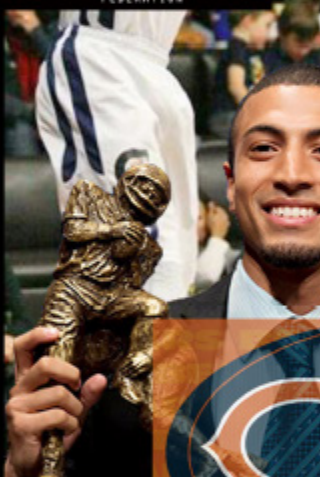
CHRIS WILLIAMS 2012 NEW MEXICO HALL OF FAME PRO ATHLETE OF THE YEAR