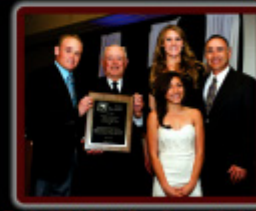
Cleveland High School Cross Country / Track & Field