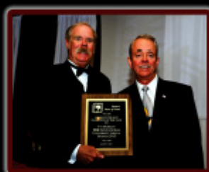
Ty Murray Invitational